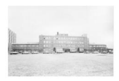
1960 : Ingham County Chest Hospital becomes Ingham Medical Hospital, a 170-bed acute care facility