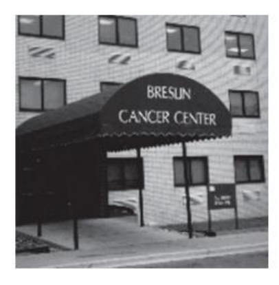
1986 : Breslin Cancer Center opens at Ingham Medical Center