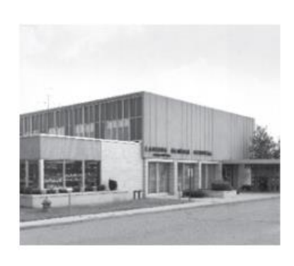
1959: McLaughlin Osteopathic Hospital moves to Pennsylvania Avenue and changes name to Lansing General Hospital

1958: Ingham County Chest Hospital receives accreditation from The Joint Commission on Hospital Accreditation