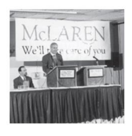
1997: A formal affiliation with McLaren Health Care commences