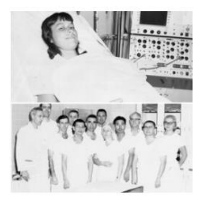
1966 : First open-heart surgery is performed to close a hole in a 15-year-old's heart