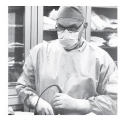
1980 : Nation's first arthroscopic surgery center opens at Ingham Medical Center