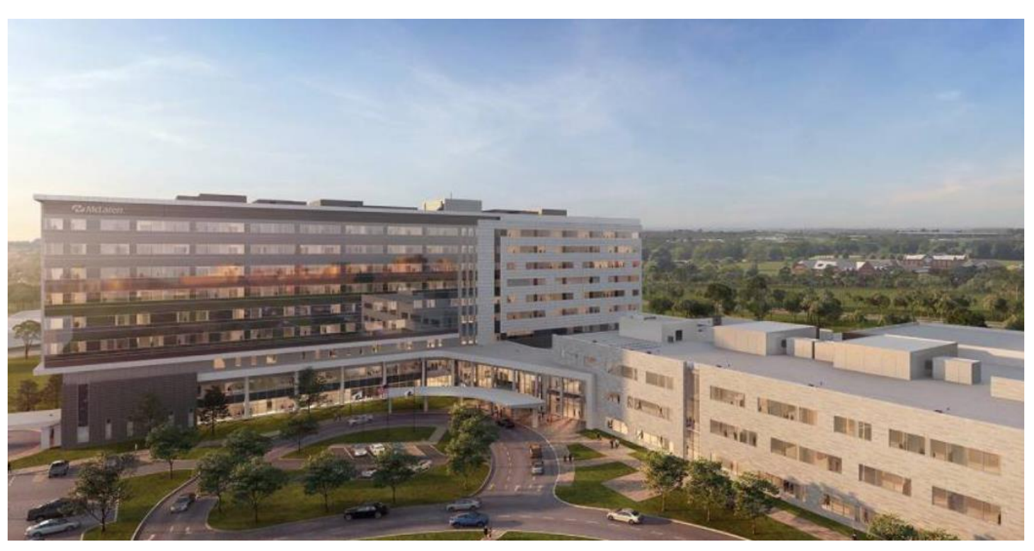
Handbook Effective- January 2022