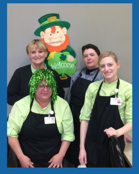
Food and Nutrition staff celebrating St. Patrick's Day